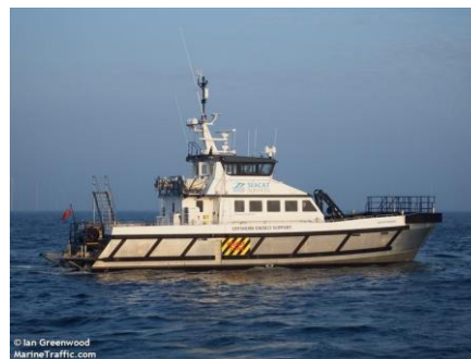
Seacat Ranger - 2HID4