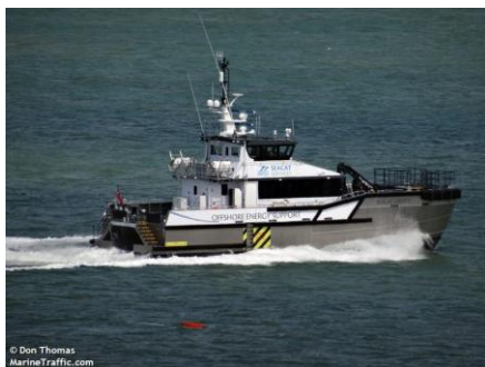
Seacat Liberty - MBJU5,

The vessel can be contacted on VHF Channel 16 throughout for any further information.