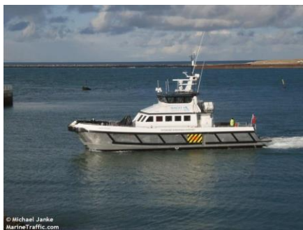
Seacat Vigilant - 2GAP6,